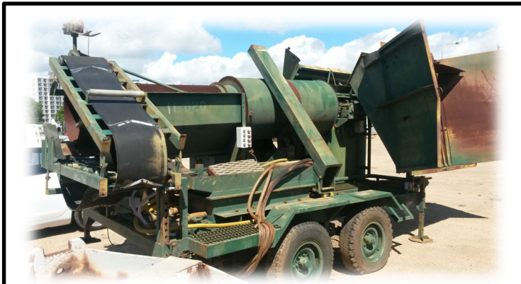
Alluvial Gold Test Plant made by AMTAS WA 25-30 meters per hour. $25,000 ono Phone: 0419 657 607

ADVERTISE YOUR MINING PLANT AND EQUIPMENT FOR SALE OR WANTED IN THE MINERS RIGHT. YOU JUST HAVE TO BE A MEMBER OF NQMA!