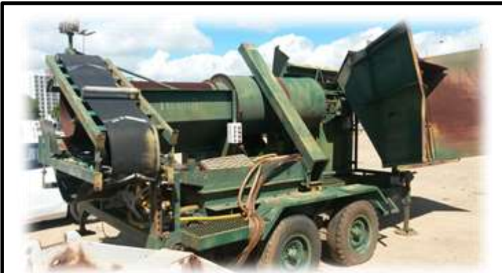
Alluvial Gold Test Plant made by AMTAS WA 25-30 meters per hour. $25,000 ono Phone: 0419 657 607